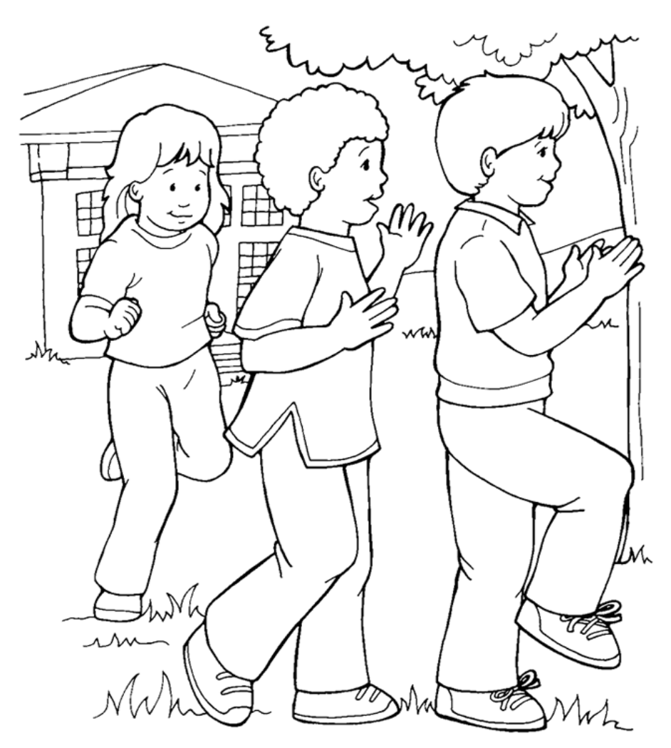
I will Follow Jesus!